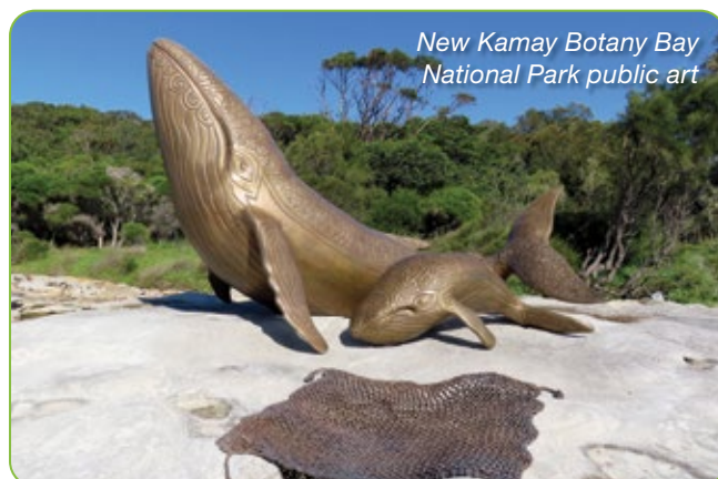
New Kamay Botany Bay National Park public art

For more information, see the Kamay Botany Bay National Park, Kurnell Master Plan at: https://bit.ly/2MgKcaH ■