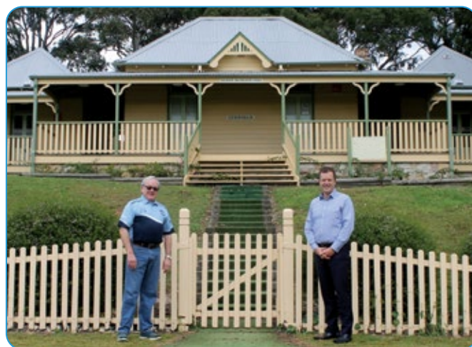
Glenn McGrath Oval Caringbah

Eight sporting organisations in the Cronulla electorate shared funding from the NSW Government's 2020 Local Sports Grant program: Cronulla Seagulls Football Club, Cronulla Sutherland Baseball Club, Elouera