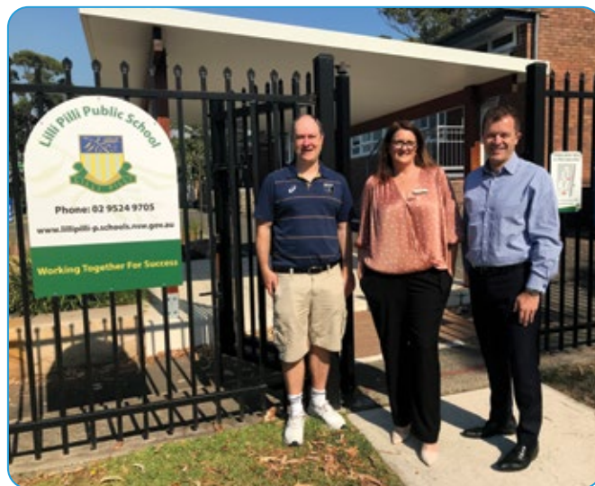
Lilli Pilli Public School