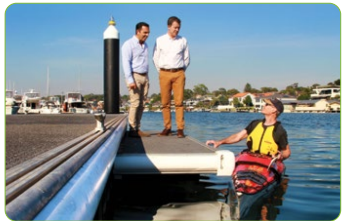
Tonkin Street boat ramp

The upgrade included a new pontoon for users to launch small craft in Gunnamatta Bay. ■