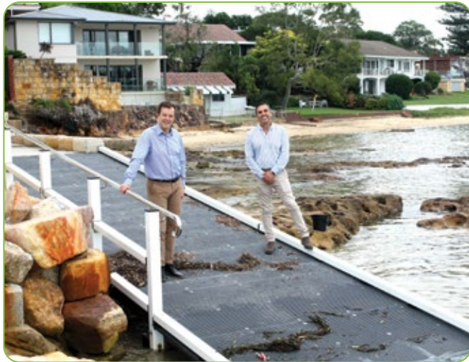
Lugano Avenue small craft-launching ramp

A new small craft-launching ramp is open at Lugano Avenue Burraneer . It provides better access and safety for users of small craft such as kayaks, canoes and surf skis, a safe distance away from the existing offshore rescue boatshed and ramp.