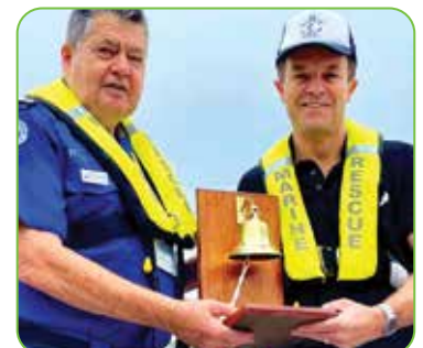
Port Hacking Putt Putt Regatta