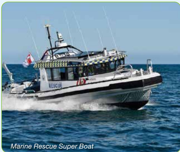
Marine Rescue Super Boat

The Marine Rescue NSW Botany Port Hacking Unit, based in Cronulla, has received the first of three Marine Rescue NSW “Super Boats”, as part of a $2.4 million investment in boating safety for NSW. Powered by three 325 horse power engines, Super Boats have the capacity to travel at speeds of up to 47kts.