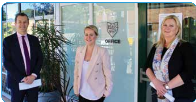
Laguna Street Public School