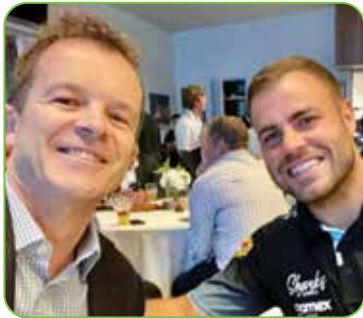
Cronulla Sharks season launch