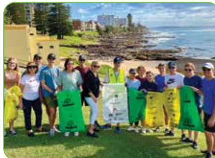
Clean-Up Australia Day