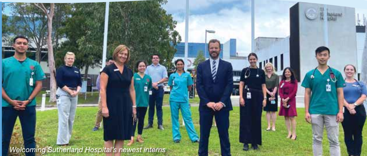
Welcoming Sutherland Hospital's newest interns