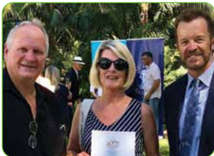
Australia Day citizenship ceremony