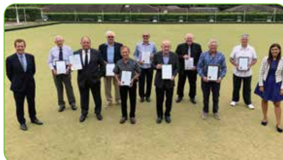
Congratulating JPs on 50 years' service