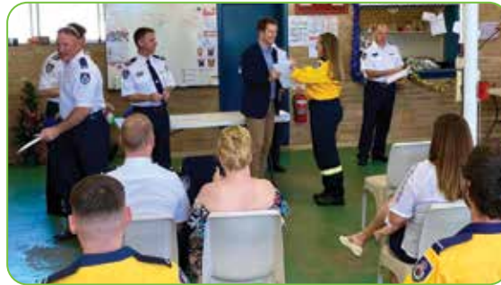
Grays Point Rural Fire Service