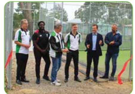
Gymea Bay Cricket Club