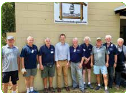
Kurnell Men's Shed