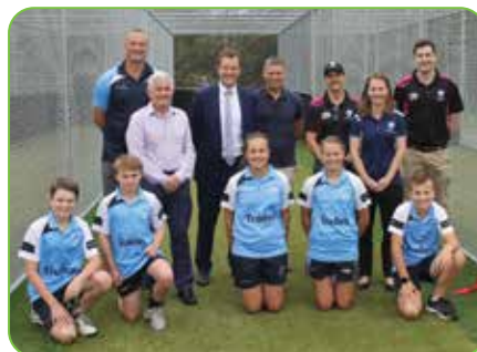
New Solander Fields cricket nets