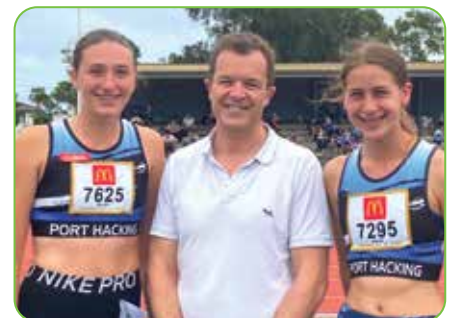
Port Hacking Little Athletics