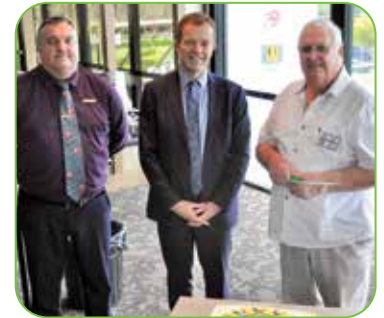
Cronulla Men's Probus 40th anniversary