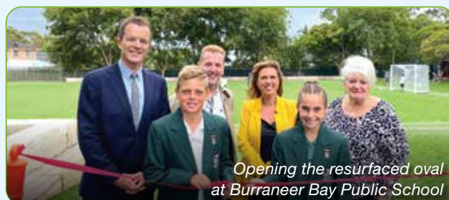
Opening the resurfaced oval at Burraneer Bay Public School

Burraneer Bay Public School's playing oval has undergone an impressive transformation, helped by a $200,000 grant from the NSW Government's My Community Project program. Congratulations to the P&C, which prepared a strong application and generated online community support.