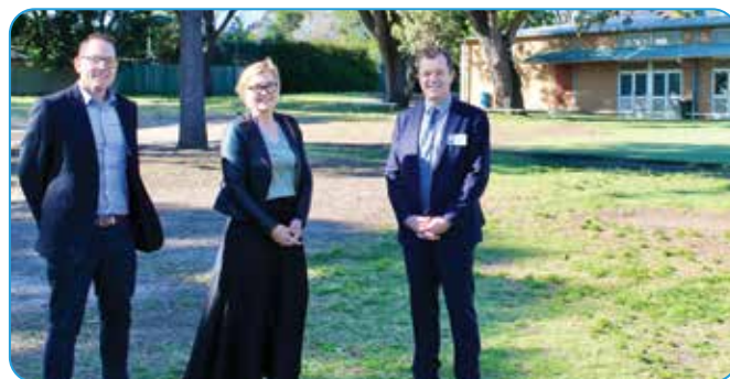
Woolooware Public School

Burraneer Bay Public School's playing oval has undergone an impressive transformation, helped by a $200,000 grant from the NSW Government's My Community Project program. Congratulations to the P&C, which prepared a strong application and generated online community support.