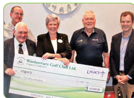
Woollooware Golf Club Legacy Day

Mark Speakman MP for Cronulla | Attorney General