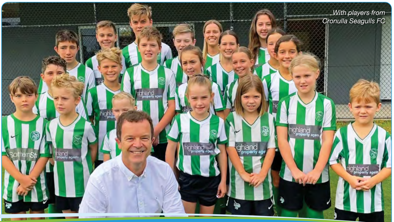
With players from Cronulla Seagulls FC