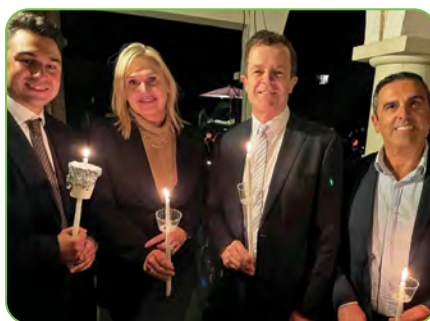
Orthodox Easter at St Stylianos Gynea