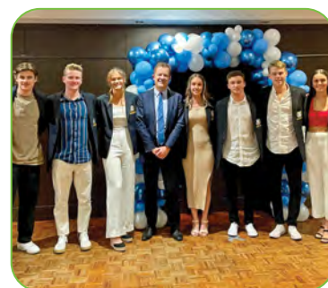
Elouera SLSC presentation