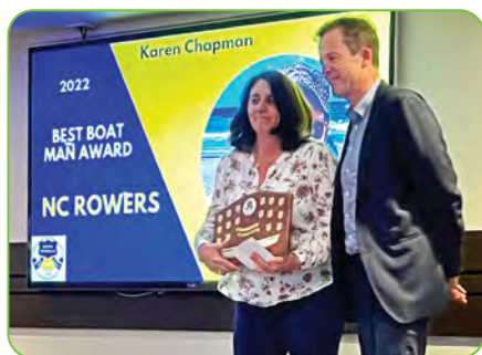
North Cronulla SLSC presentation