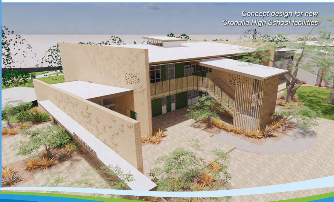
Concept design for new Cronulla High School facilities