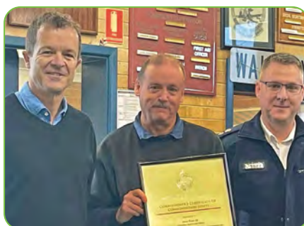
Grays Point Rural Fire Service