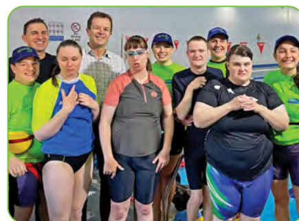
Rainbow Club Australia Caringbah