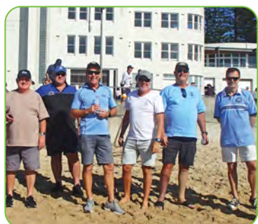
Cronulla Polar Bears season launch