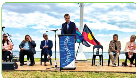
Meeting of Two Cultures at Kurnell