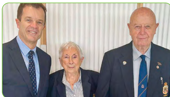
Caringbah RSL sub-branch Anzac Day luncheon