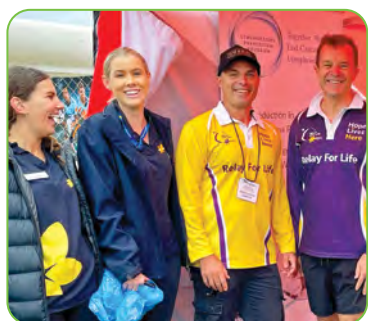
Shire Relay for Life