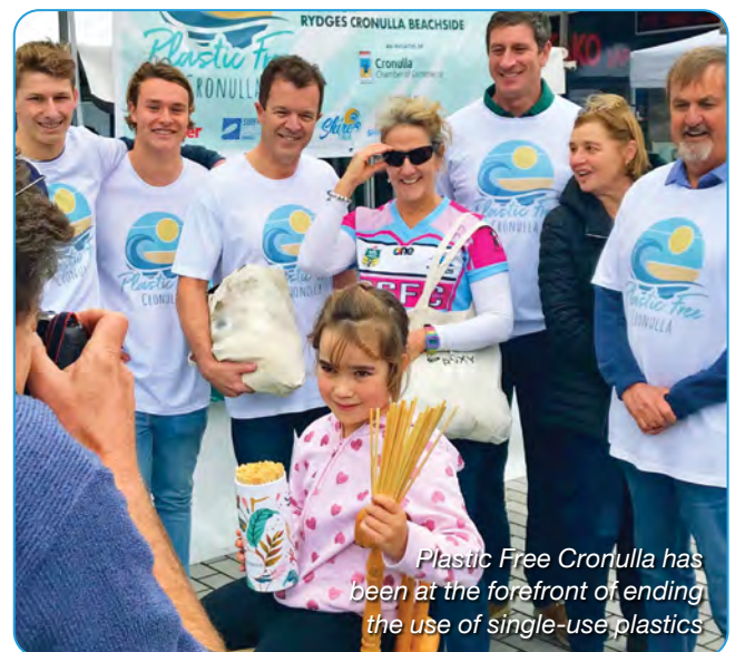
Plastic Free Cronulla has been at the forefront of ending the use of single-use plastics

Single-use plastic items and packaging make up 60% of all litter in NSW, so stopping the supply of problematic plastic will help prevent it from entering our environment as litter, or going into landfill.