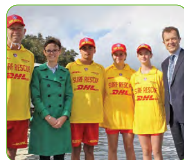
Water safety media event with Cronulla SLSC