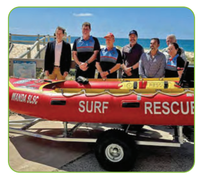
Wanda SLSC boat launch