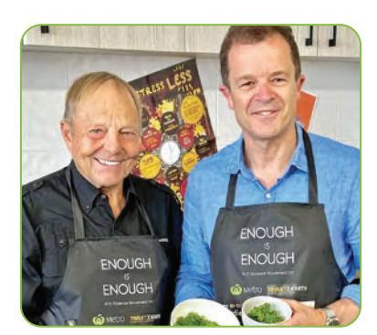
Enough is Enough