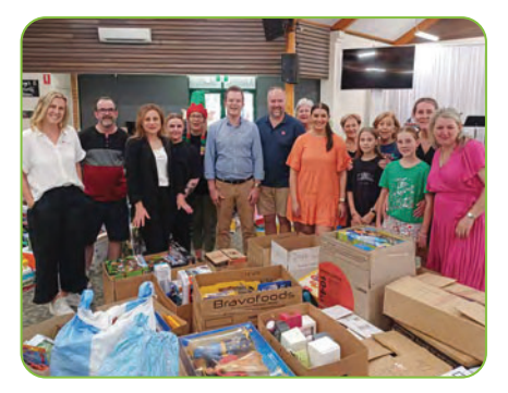
Christmas hamper packing at Salvos